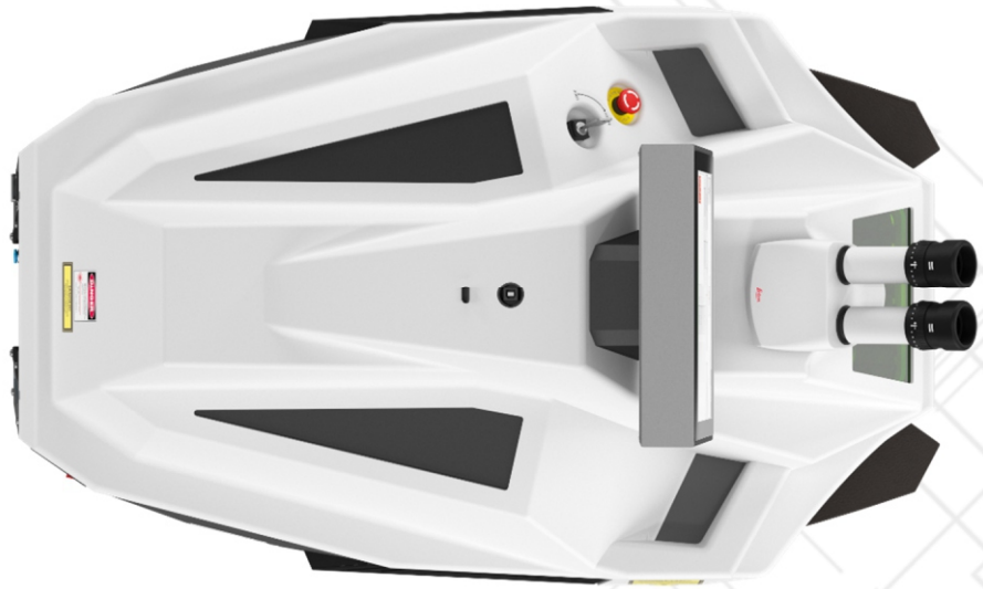
TABLE-TOP MANUAL LASER WELDER